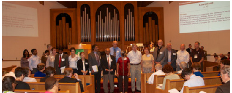
Presbytery approved the covenant that formalizes the relationship between FUPC & CSID at Grace Presbytery meeting

I am also very thankful for the continuing relationship with the Church of South India, Dallas. It is a blessing to share space and be ministry partners with the good people of CSID. At a recent meeting of Grace Presbytery the relationship between CSID, Faith United and Grace Presbytery was for-