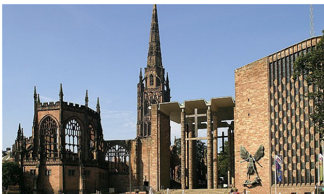
Canterbury Cathedral, England

Cotswolds, Warwick Castle, Birmingham and most memorable Canterbury Cathedral. This cathedral was