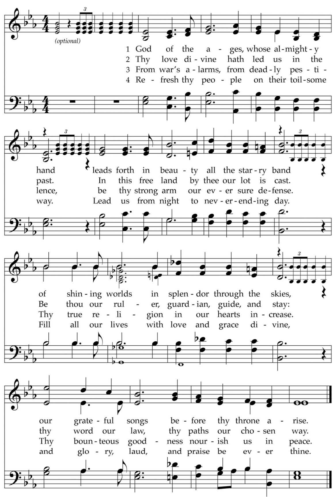
This hymn was generated by 19th-century centennial celebrations: the words by the Declaration of Independence and the music by the adoption of the United States Constitution. Despite these origins, no specific nation is mentioned in this hymn of praise and prayer for peace.