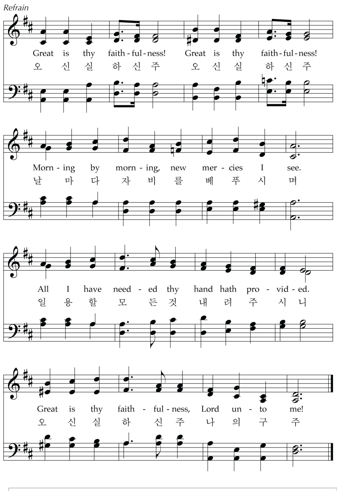
Great Is Thy Faithfulness - cont.